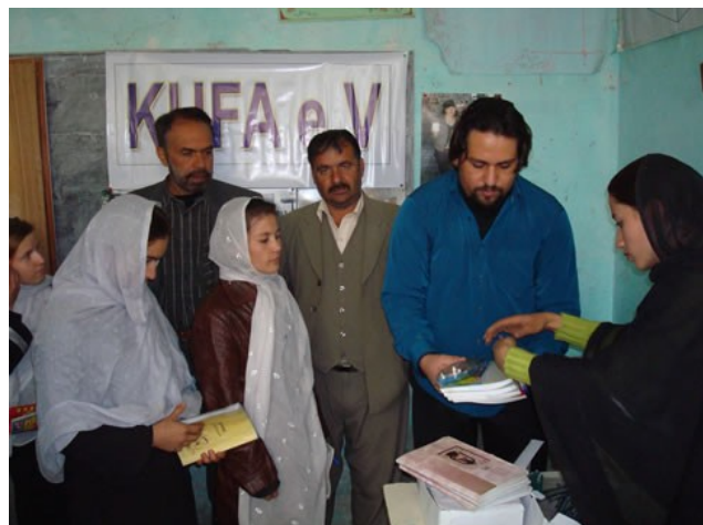
Verteilung der Unterrichtsmaterialien in der Deh Kepak Mädchenschule