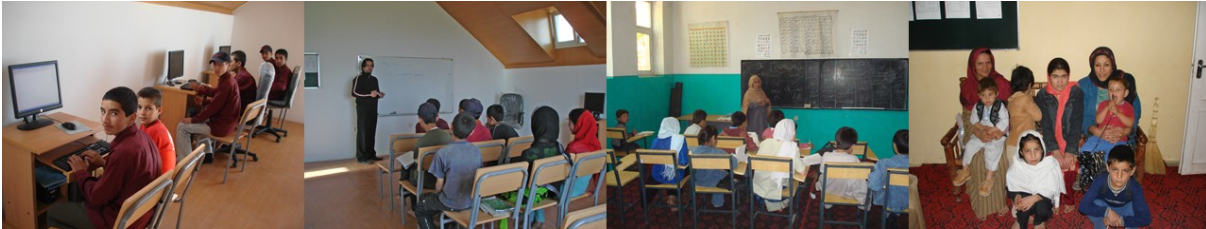
Fototermin in den Unterrichtsräumen

KUFA registered association quite obtained successes in the year 2007 despite the difficult situation in Afghanistan. For the woman and orphanage in Kabul two teachers could be adjusted, be given the computer and English courses with your assistance. Girls and boys participate together in instruction.