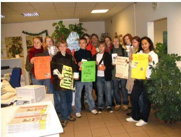
„Spenden ist Bildung für Afghanistan“: Schüler aus Kaltkirchen mit Plakaten

Just as large thanks go at all the organizations and private people, which supported KUFA last year with creative actions. As for example the Rudolf Steiner School cold churches, whose respected class on a road collection over 700 euros at donation funds gathered. With the money teaching materials for needy pupils of the Deh Kepak Mädchenschule were acquired with Kabul.